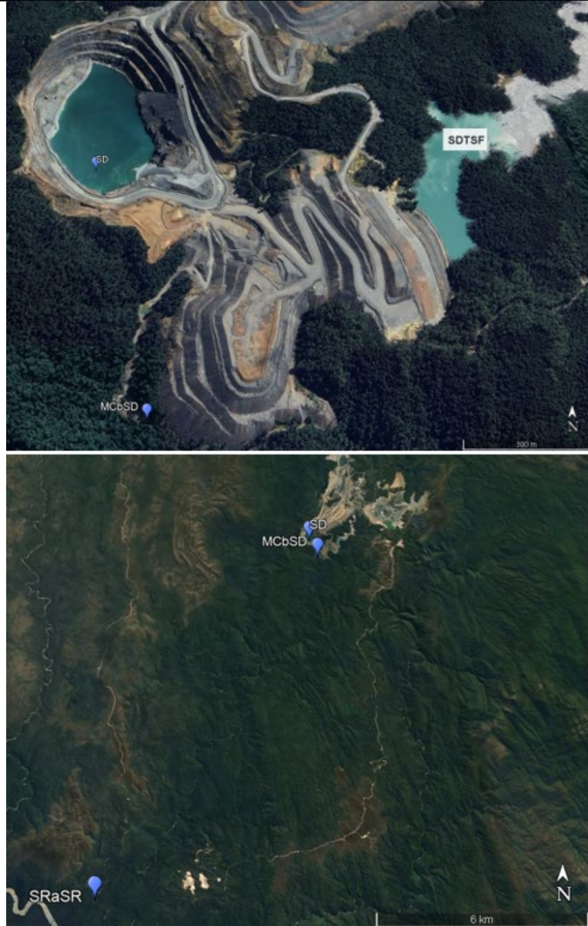
Figure 2 - Monitoring Locations