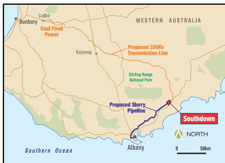
Figure 2: Map showing the Southdown Joint Venture Project

Located approximately 90 kilometres northeast of the Port of Albany on the south coast of Western Australia (Figure 2), the Southdown magnetite deposit is approximately 12 km in length and represents one of the best premium quality magnetite deposits currently under development in Australia. With a location near existing port facilities, an ore body close to surface and near the regional population centre of Albany, the deposit is favourably placed for development.